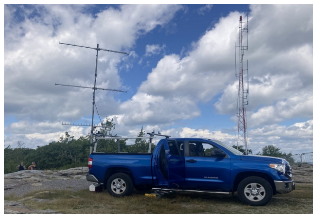
Fig 1. Portable 222/432/1296 MHz Antennas

This year I wanted to try and operate from the summit of Mt Wachusett (2001-foot elevation). While it’s easy to operate from the parking lot at the top of Mt Wachusett, operating from the actual summit requires a special permit from the state. Several months ahead I applied for a special permit and posted a $1M liability insurance certificate. My permit arrived about a week before the contest, just in time.